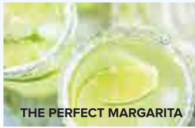
THE PERFECT MARGARITA